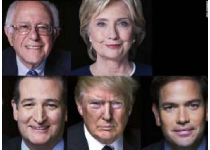
The principle figures in the race for the White House. Clockwise from the top left they are: Bernie Sanders, Hillary Clinton, Marco Rubio, Donald Trump and Ted Cruz.

Donald Trump is a businessman, billionaire, TV personality, and cultural phenomenon. Unafraid to rock the boat, Trump has made