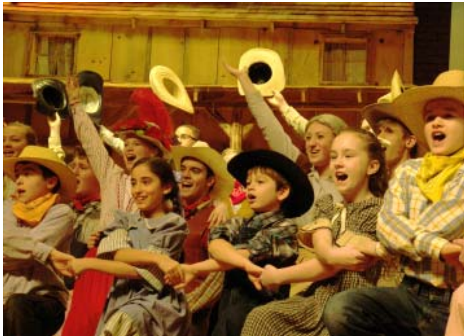
Quirk’s Players provided an entertaining preview to this weekend’s musical production of Oklahoma! on Thursday morning, before embarking on the first of their four performances on Thursday night. The group will be at it again tonight a 7:30 pm and tomorrow at 2 pm and 7:30 pm.

All newly eligible voters are reminded to register to vote, as the primary for New York is April 19. If you are 18 by November 8th, 2016, you are eligible to register to vote and vote in the primaries. Absentee ballots are another option, if you are out of state or unable to go out and vote on the day of voting, it is possible to still vote by filling out an absentee ballot.