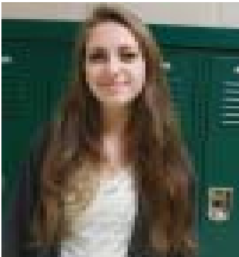
"Sam Hunt ."