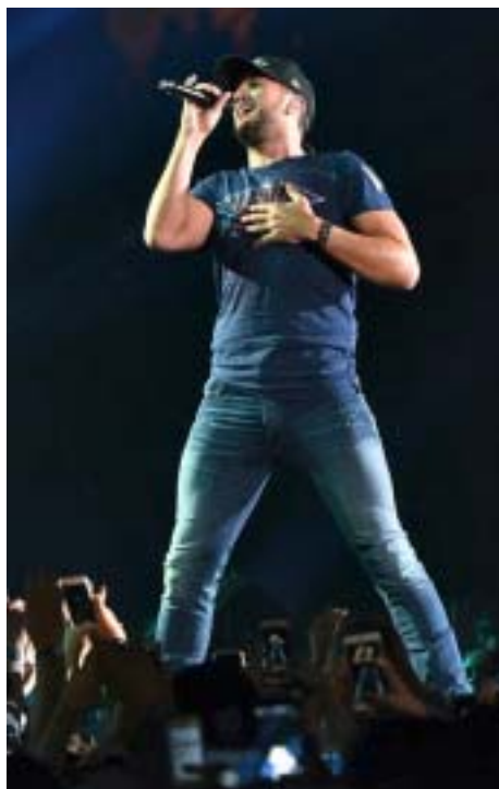
Luke Bryan, the Country Music Association's "Entertainer of the Year" lived up to his award on Saturday at the Dome.

At the end of the show Luke left the stage and all the lights turned off in the Dome. A