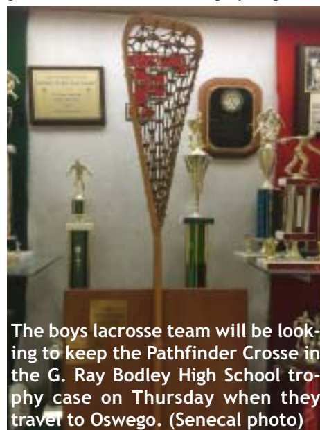
The boys lacrosse team will be looking to keep the Pathfinder Crosse in the G. Ray Bodley High School trophy case on Thursday when they travel to Oswego.

Both teams will have one final tune-up before Thursday's contest as the 1-2 Raiders host Onondaga at 6:30 pm while the Bucs face Jordan-Elbridge, looking for their first win following an 0-3 start.