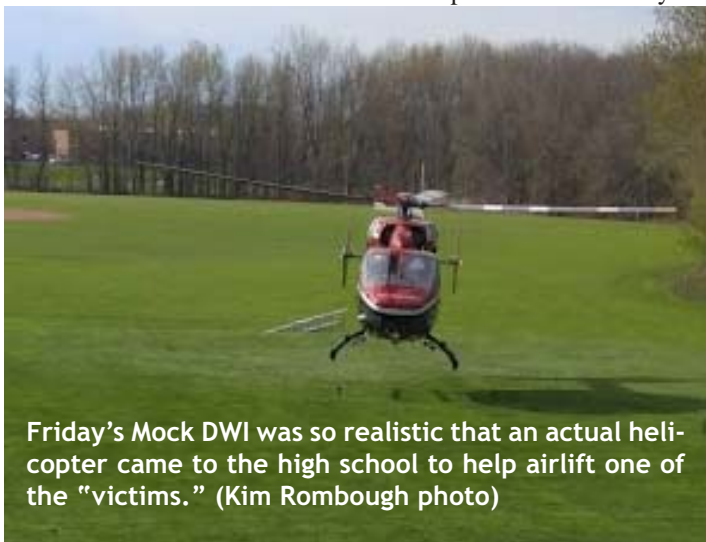
Friday's Mock DWI was so realistic that an actual helicopter came to the high school to help airlift one of the "victims."

Wednesday: Homemade cheese pizza, broccoli, butternut squash, mixed fruit