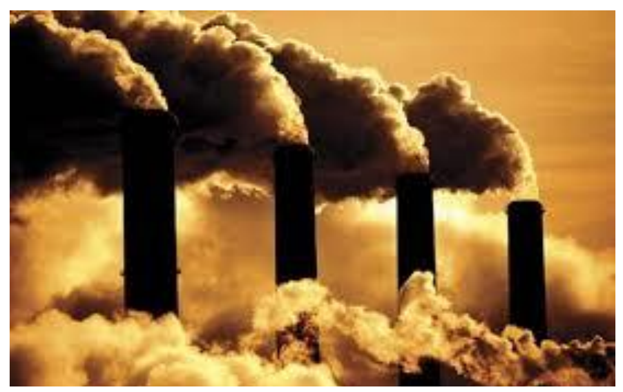
Extreme burning of fossil fuels creates CO<sub>2</sub> build-up.

Years of data have been collected by scientists to show how the environmental changes have proceeded over time. Even though I have been alive only eighteen years, I have noticed the strange change in weather and the environment. It is all over the news, and we really should start taking the environmental changes seriously.