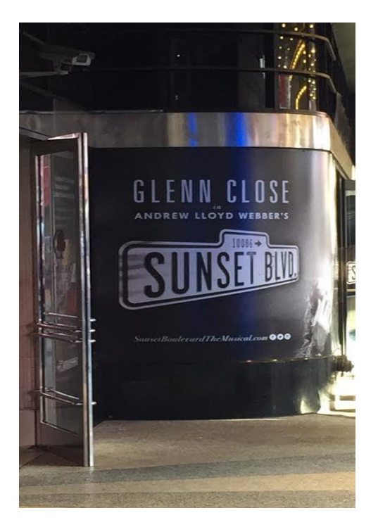
Students enjoyed the musical Sunset Boulevard.

The musical seemed like a great opportunity for G.R.B students to watch master actors and actresses and to see the many iconic sights of the Big Apple.