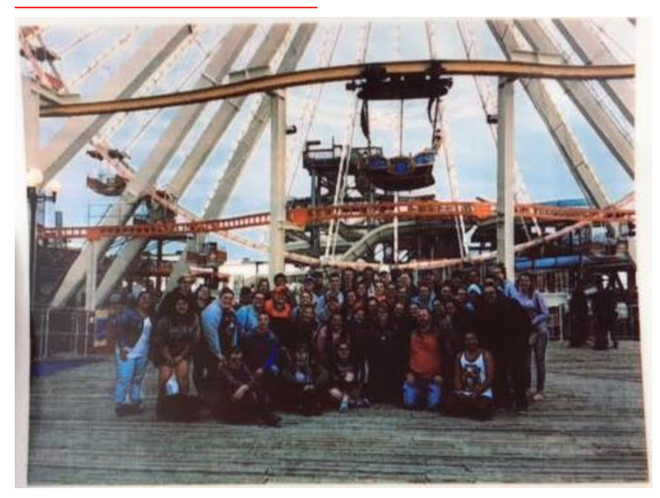
Pictured are members of the Class of 2017 at Morey's Pier amusement park during their senior trip.

Early morning on Friday, May 19 students of the senior class got ready to hit the road for their senior trip to Wildwood, New Jersey. The first stop the seniors made was to Cape May Zoo where we ate some lunch and saw many animals.