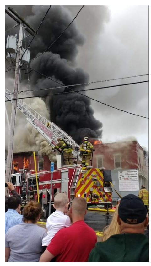
Local residents watch as the fire rages in Oswego on Saturday, May 27.

Thanks to the Oswego Fire Department, the fire was quickly contained and did not spread to any other buildings. Now all that is left is to sift through the debris and try to determine what caused the fire.