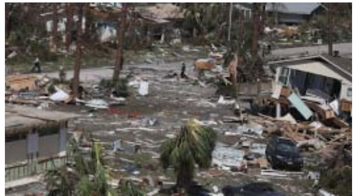
Hurricane Michael left a path of destruction in its wake after hitting the Florida panhandle last week.

Overall the numbers do not look good. Across Bay County, more than 2,500 structures are damaged, and at least 162 have been de-