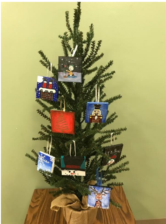
Ornaments designed and painted by members of the Art Club are displayed on the tree in Mrs. Ingersoll's office.

If you are looking for decor for your Christmas tree, here is your stop. With lots of choices, it is difficult to pick just one.