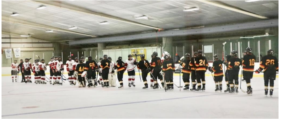
The Raiders meet The Ontario Bay Storm after their 7-0 victory on November 24 in Fulton.

The Raiders won the game 7-0 and are looking forward to their first game against the Baldwinsville Bees on Friday, November 30 in Baldwinsville at 5:30 p.m.