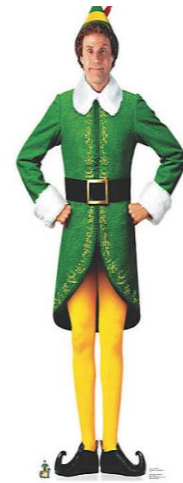
Pictured is Buddy, star of the movie Elf, which is a Christmas favorite.

Enjoy your favorite Christmas movies this season!