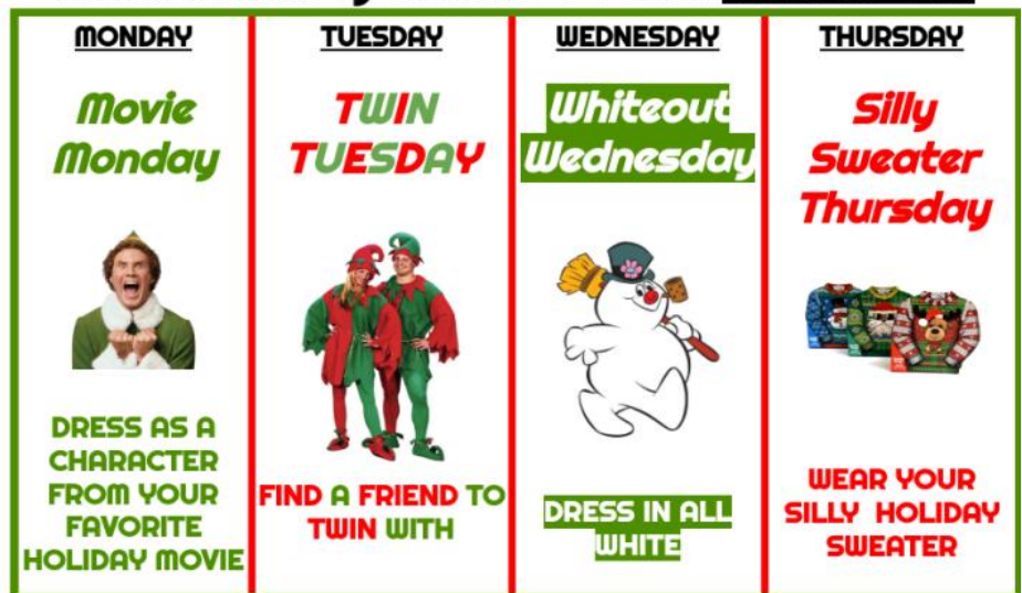
Pictured is the lineup for next week's Holiday Spirit Week.