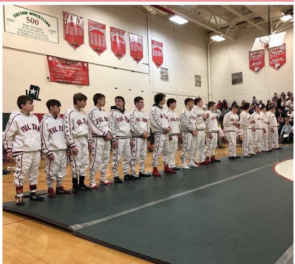
On Wednesday, December 5, the GRB wrestlers faced off against Central Square. They won easily with a score of 65-14 to solidify their first dual win of the season.