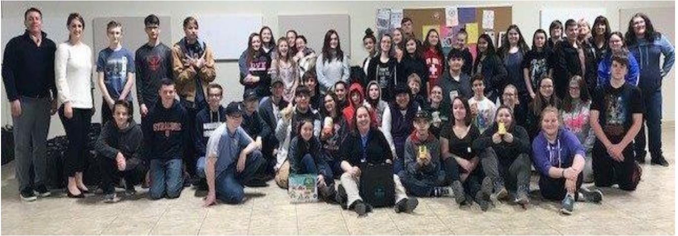
Pictured is the group of sophomores and freshmen who attended the field trip to Catholic Charities to pack food boxes.

"It was nice to take a break from the school day to help out others."