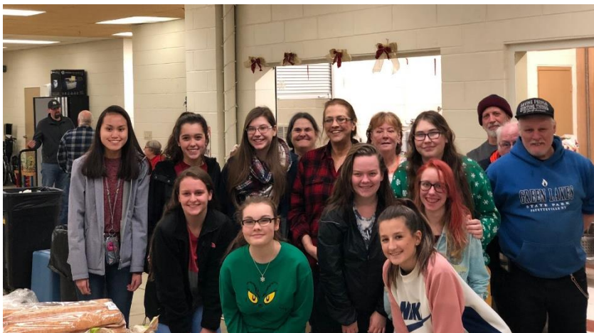
Pictured are members of GRB's HOPE Club and WGRB along with volunteers from Believers' Chapel.

The group packed a total of 300 boxes to be distributed. The boxes that were packed consisted of seven canned goods, three vegetables, two sweet potatoes, two cans of sauce, a bag of pasta, a bag of rice, a gingerbread house, and additional gift certificates for food purchases.