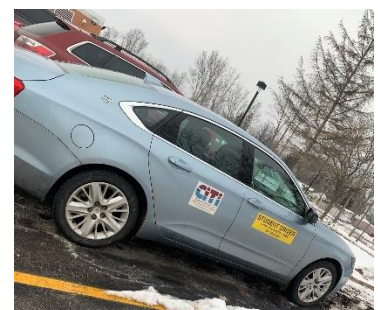
The Driver's Education car waits for the Spring session of GRB students to begin classes in February.

Don't forget to turn in registration forms and payments to the Counseling Office by the end of the day tomorrow!