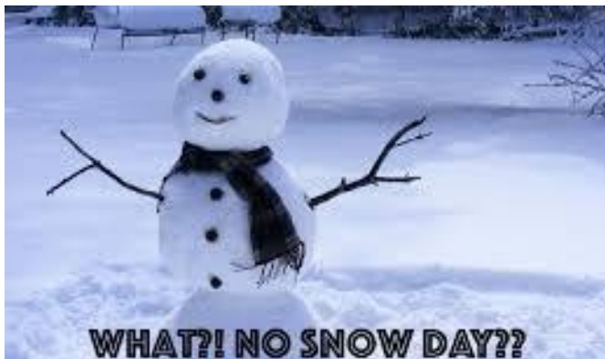
Some students were disappointed and confused to have to come to school at the normal time on Thursday, January 10.

Many students were upset to not have a Snow Day because they had to drive in the snow and it really was not safe to drive in. Many students also have to walk to school and the weather is definitely not good for people to be walking in.